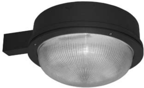
Vega QVA With Extruded Aluminum Arm

LED fixtures providing better energy efficiency and a better quality of useable light.